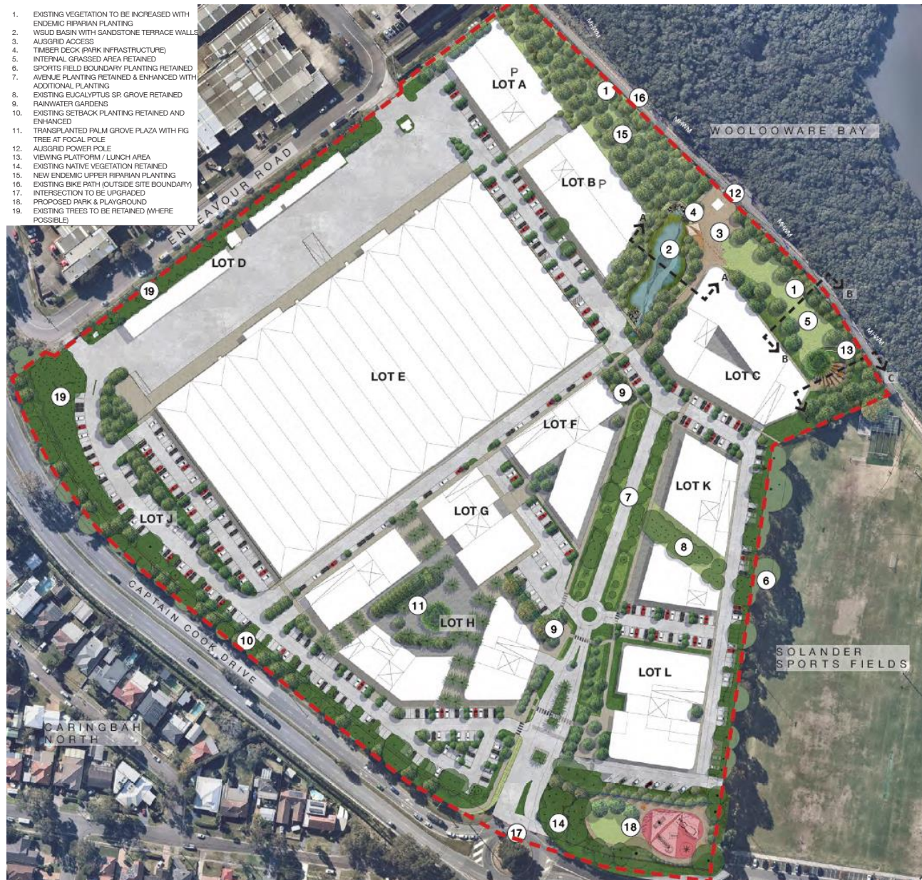
Figure 6 Landscape Strategy