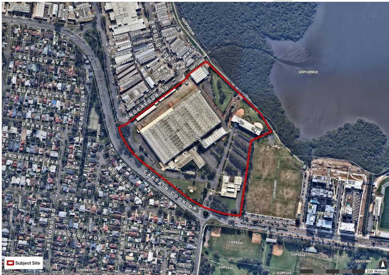
Figure 1 The Site

A transmission easement traverses the northern portion of the site, with the support structure located in the north-eastern corner. This easement consumes some 9,000sqm of the site area.