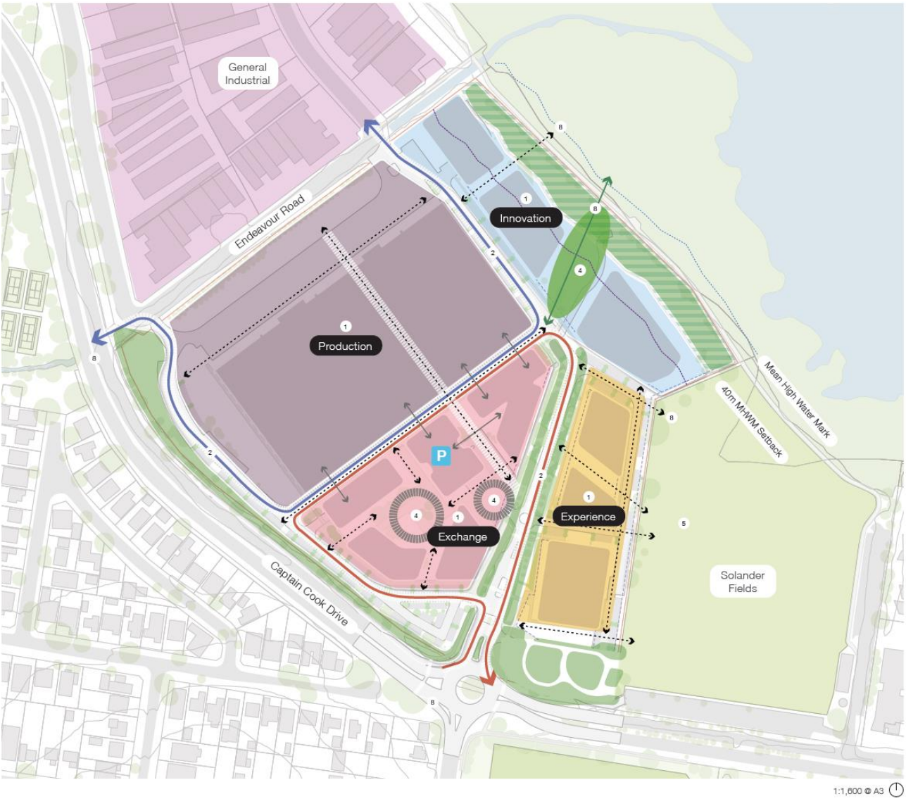
Figure 2 Character Areas